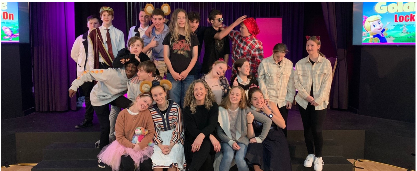
Stage 2 Drama – Bethel Park Falls