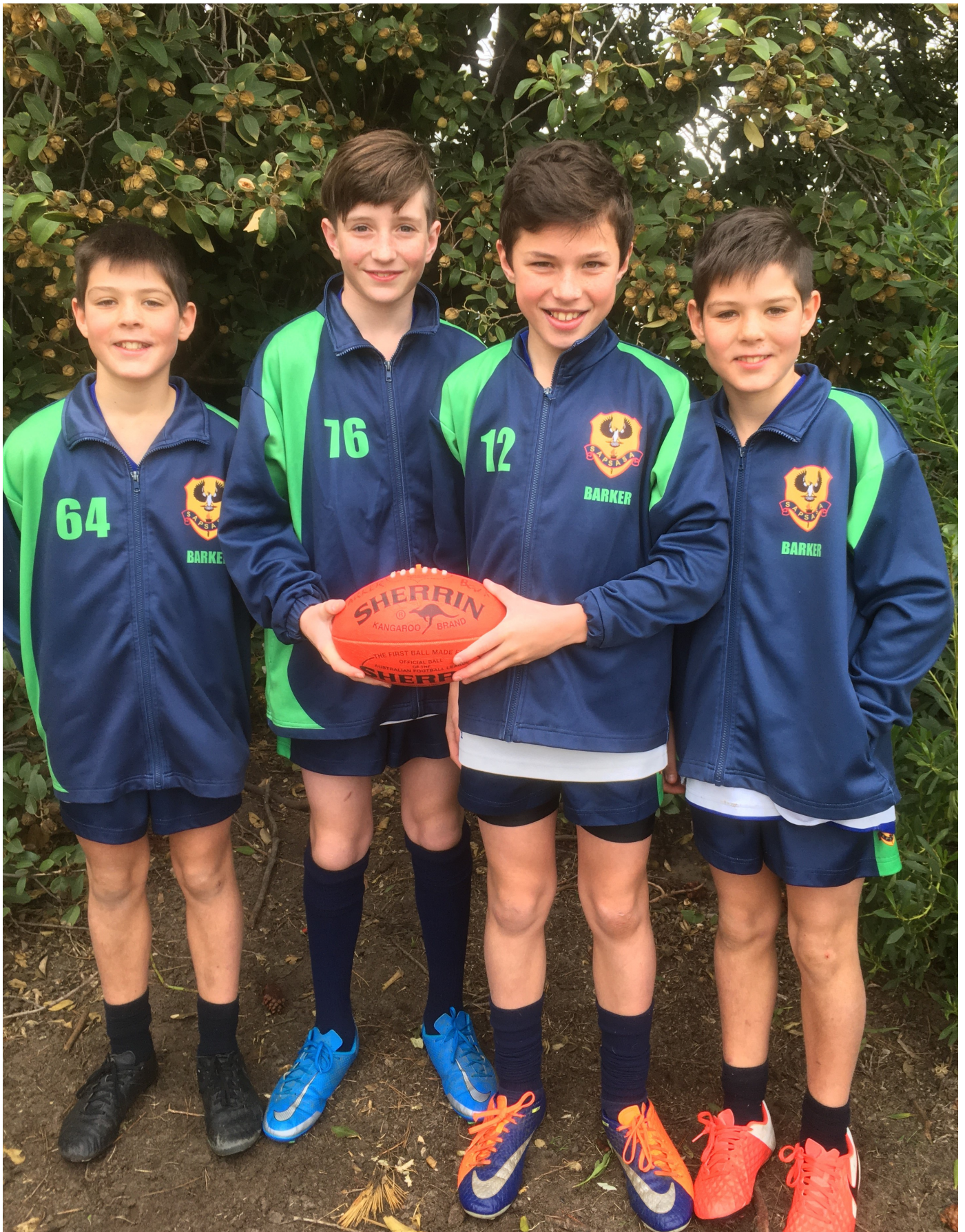
Well done to our Year 6 students who represented Barker SAPSASA. The team finished 5th overall.