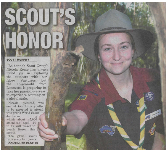
Article: The Mt Barker Courier , 19 July 2023.